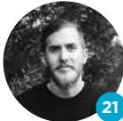
BURNLEY Eranthos Beretta