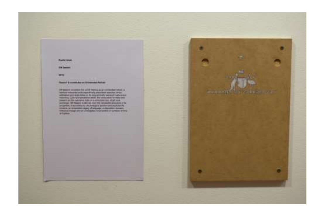
Raafat Ishak Off Season 2015